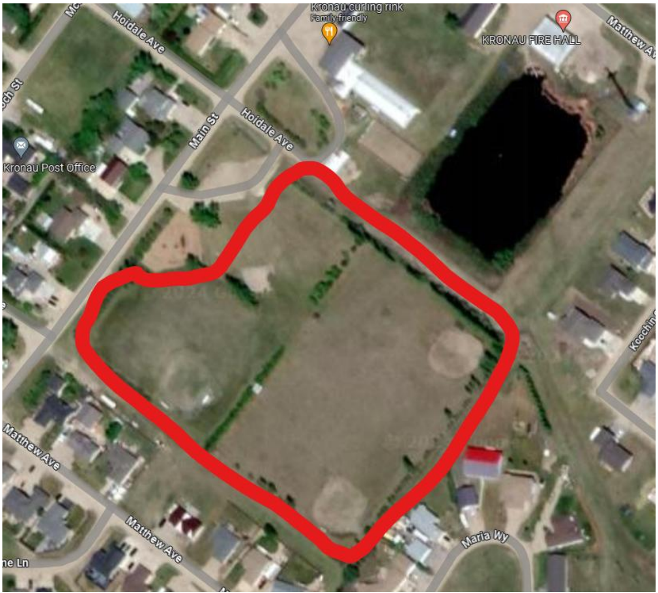
Hamlet of Kronau – Ball Diamonds