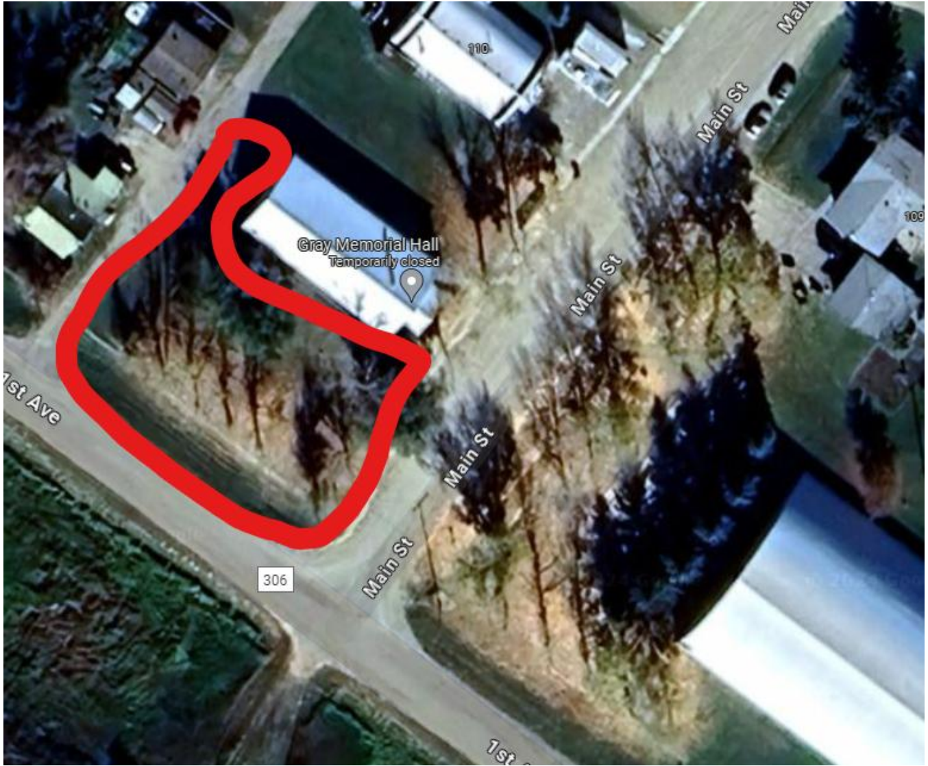
Gray Memorial Hall