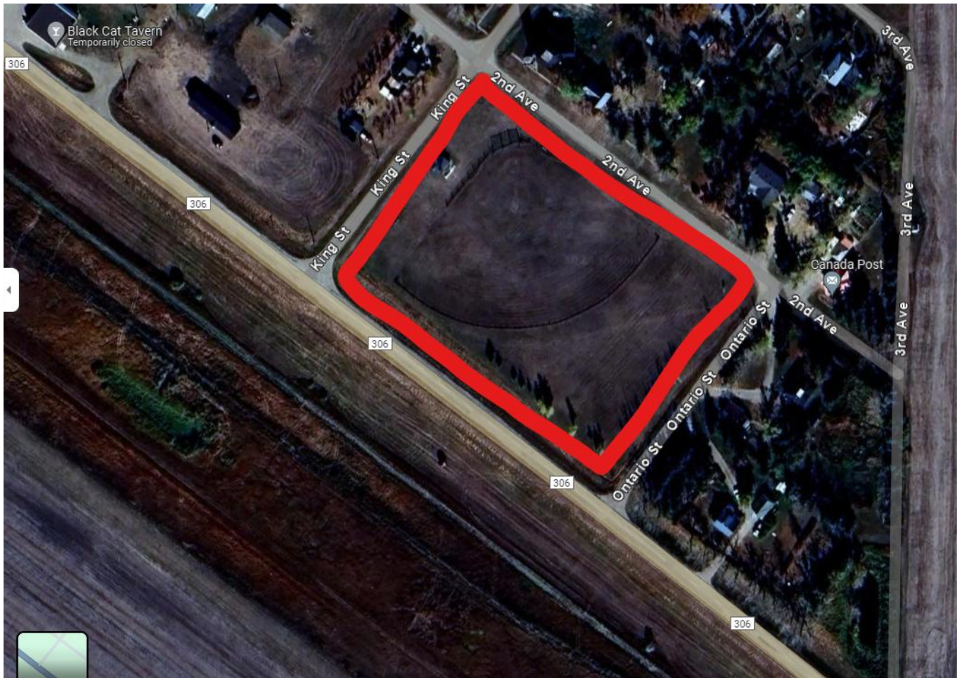
Hamlet of Riceton - Ball Diamonds