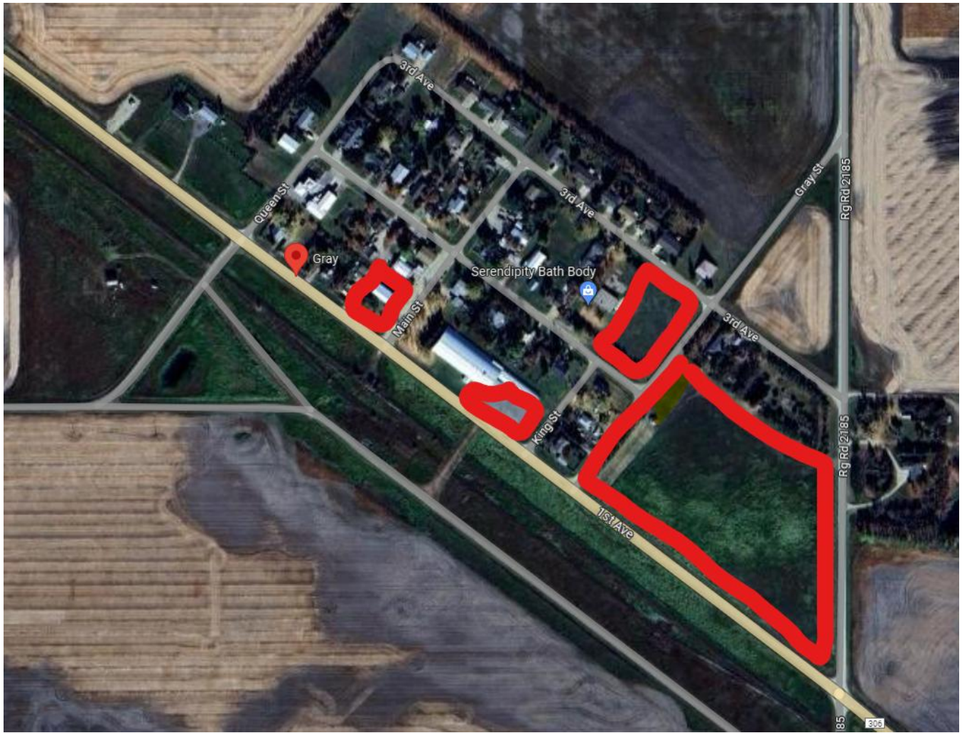
Hamlet of Gray – Ball Diamonds Hamlet of Gray – Rink Parking Area Hamlet of Gray – Community Hall