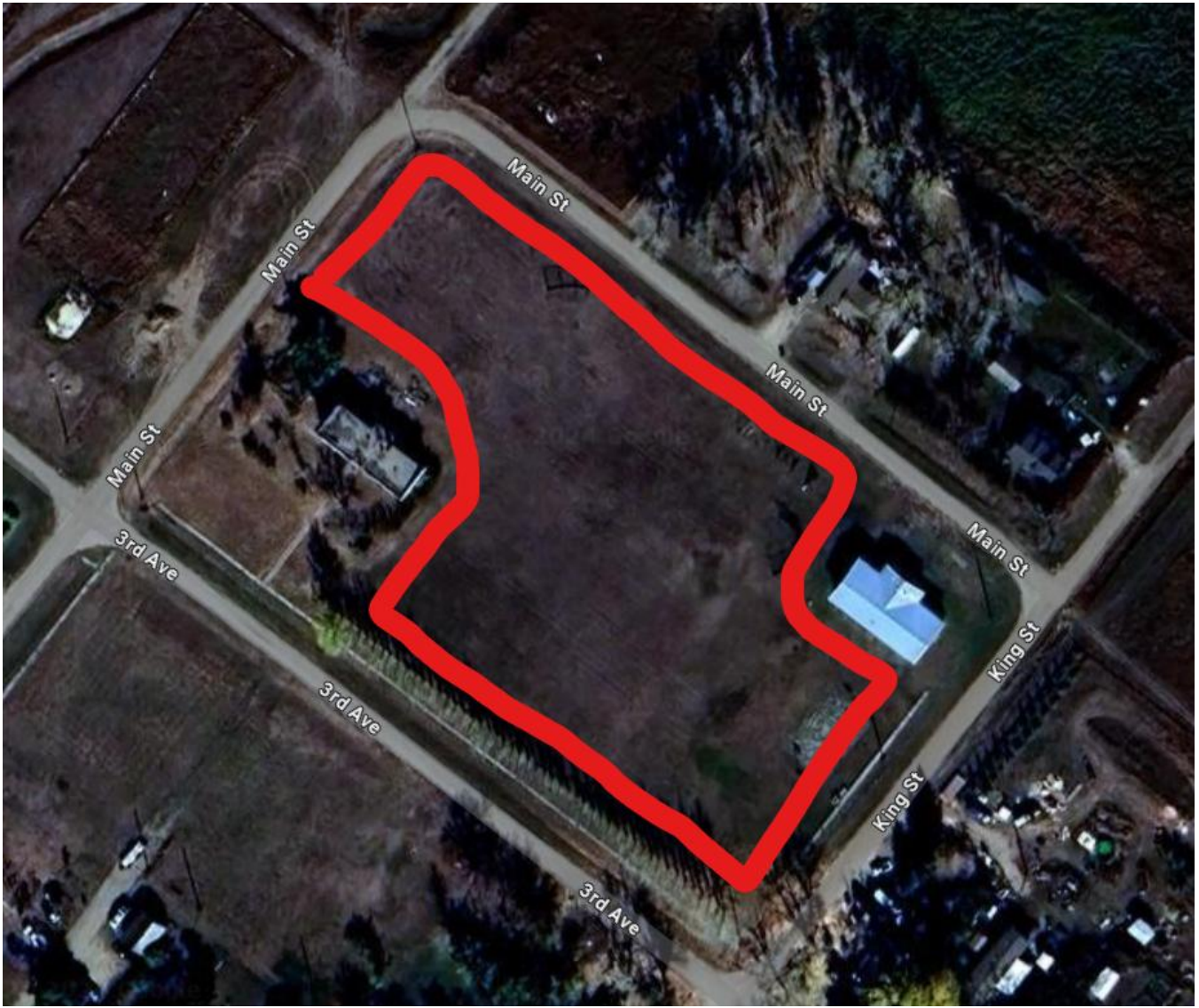
Hamlet of Riceton - Ball Diamonds